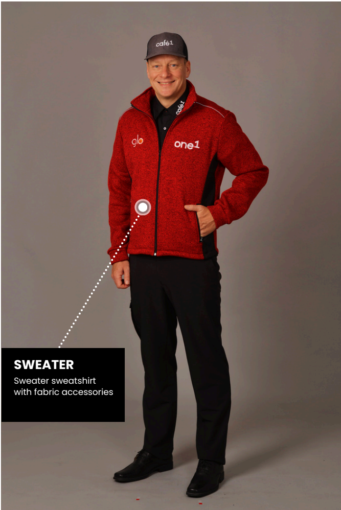
SWEATER Sweater sweatshirt with fabric accessories