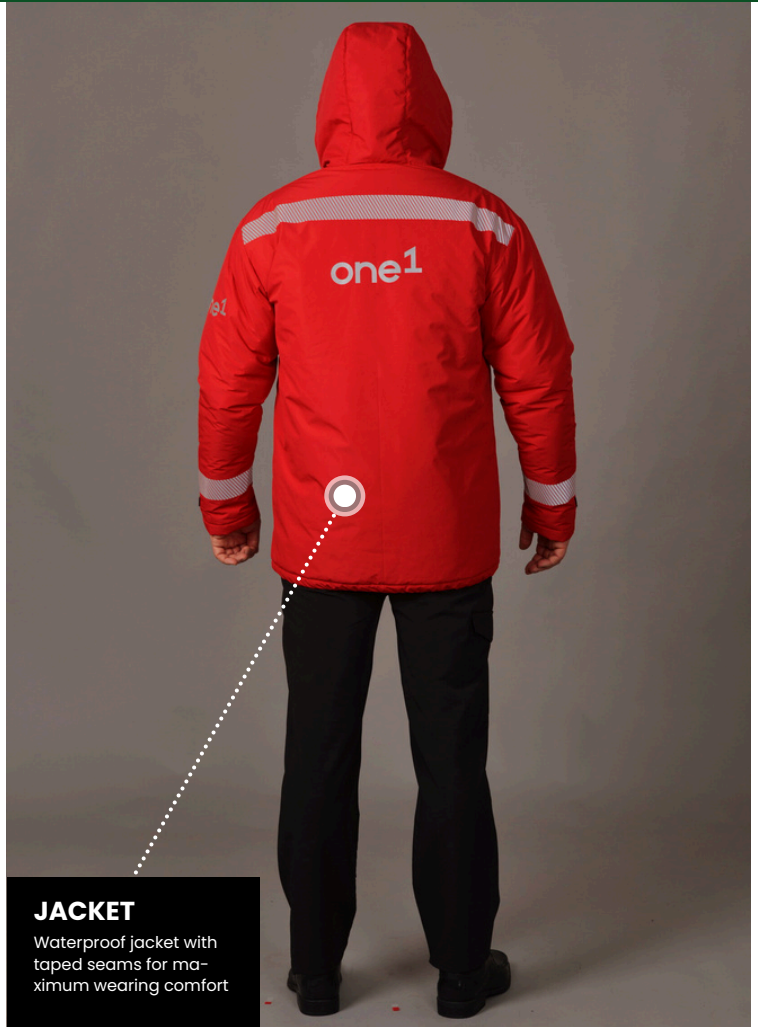
JACKET Waterproof jacket with taped seams for maximum wearing comfort